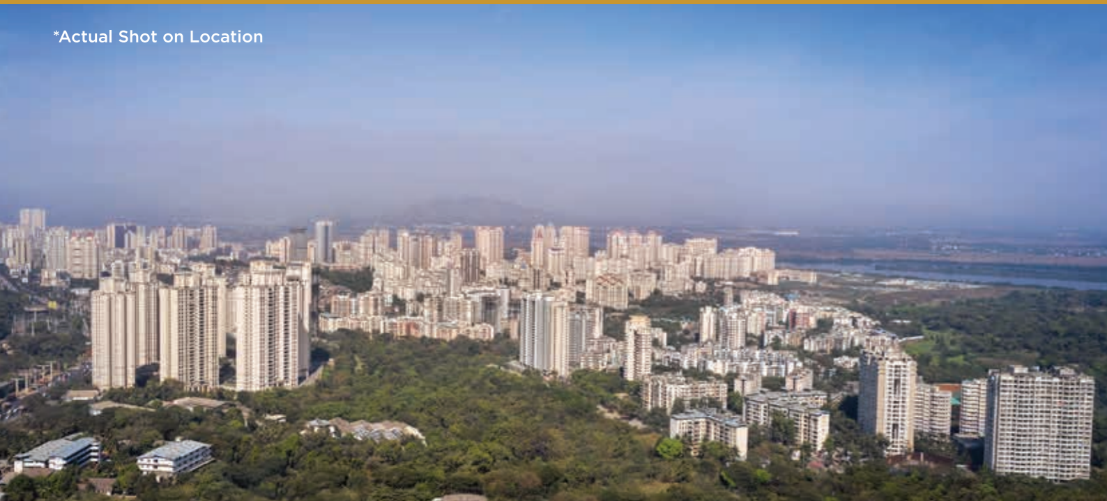
*Actual Shot on Location